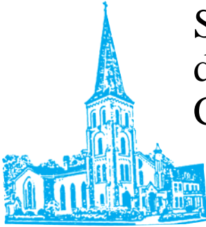
St. Francis deSales Church

130 Exchange St., Geneva, New York 14456